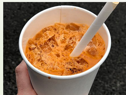
Thai Iced Tea in a paper cup and paper straw https://commons.wikimedia.org/wiki/File:E-saan_thai_house_-_Sarah_Stierch_-_May_2019.jpg

In recent times, we hear a lot about circular economy, a model in which resources are used again and again, minimum amount of waste is produced, and nature is kept safe, if not even regenerated. Circular Economy is part of the European Union environmental and economic strategy.