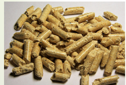
A huddle of wood pellets

In the Circular Economy, CE, waste and pollution should be eliminated (first principle of CE), materials and products should be kept in use, or circulate (second principle), and the natural processes are supported to regenerate nature (third principle). 4