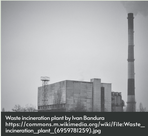
Waste incineration plant

The economy that has been in place until now is nowadays identified as linear: the production of a good or starts with the extraction of raw material from the Earth; then a product is made, it is used for a short or long period of time, and eventually it is thrown away as waste.